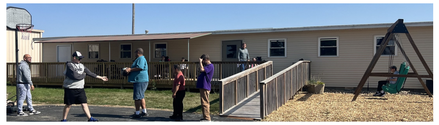
The Village View, Fall 2024, page 3