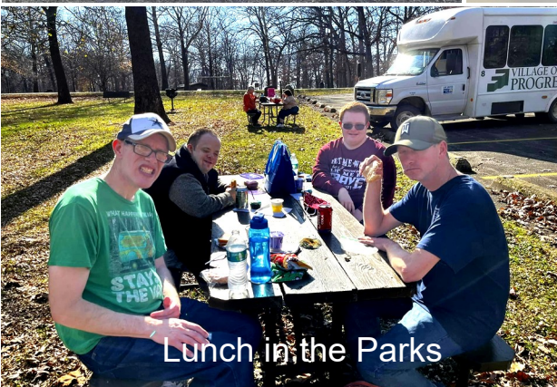
Lunch in the Parks