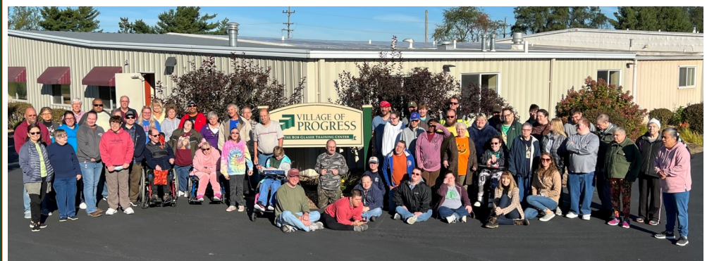
The Village of Progress gathers for our annual photo.