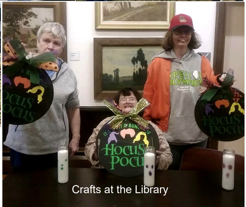
Crafts at the Library