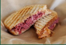
Corned Beef Rye