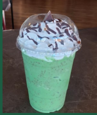
Andes Mint Lattes