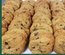
Mint Chocolate Chunk Cookies