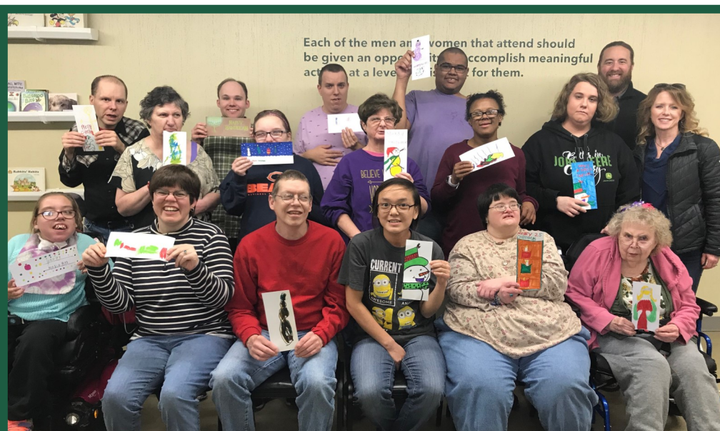
2019 Christmas Card Contest Participants & Judges