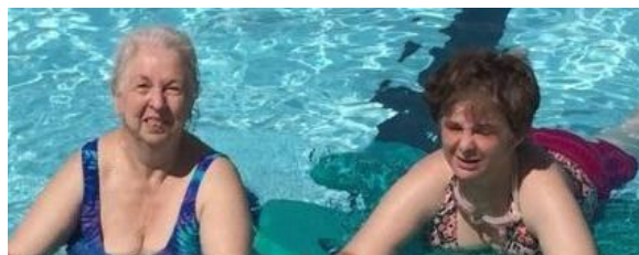
Every year special Olympic athletes and their families celebrate the season with a swim party and cookout at the city pool in Polo.