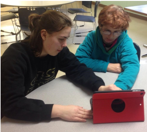
IPads help create an instant connection between high school volunteers and our men and women.