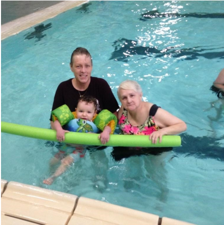
Several staff worked hard to put on a late-winter 'Flick & Float' and pot-luck at the Nash Center. There was a great turn out with loads of fun!