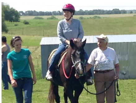
Over $4,000 was donated to support our participation in Pegasus' therapeutic riding lessons .