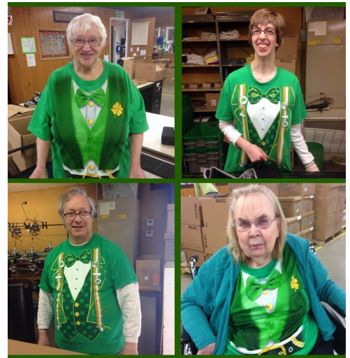
St. Patrick's Day at the Village of Progress. Lots of leprechaun sightings!