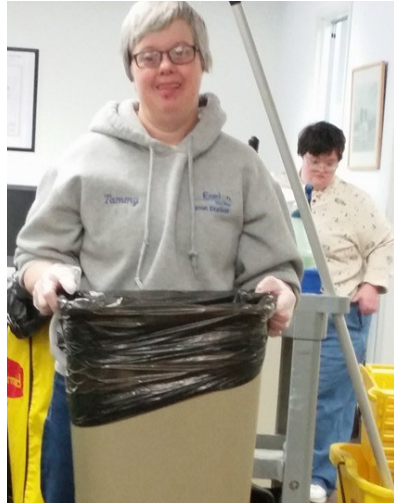
Our janitorial crew happy and hard at work!