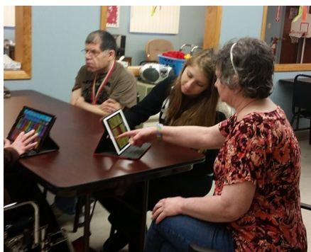
Apple has many apps that engage people with developmental disabilities. This year we were fortunate to be able to purchase two iPads.