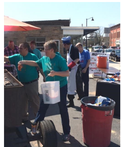
Great day and a great turnout for the Snyder's Ace Hardware grand opening. Thanks Snyder's for inviting us to host the cookout. We received over $1,100 in donations.