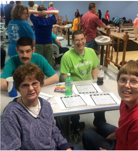
Staff planned another fabulous family-friendly event last month — bowling and a potluck at Towne & Country Lanes. Food and fun is the common theme.