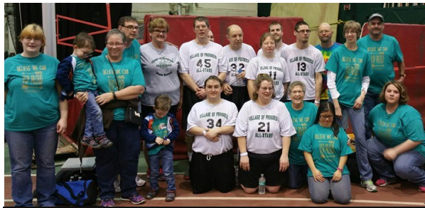
Men and women from the Village joined the All Stars in Bloomington to cheer on their team.

First, the Village All Stars team scored a come-from-behind victory at the District Tournament in Byron, securing a first place finish and sending them on to